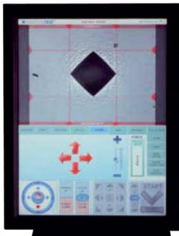
Full Screen, Zoom