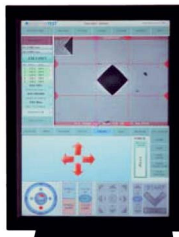
Magnified, Fine Adjustment