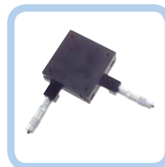
Table Option 1