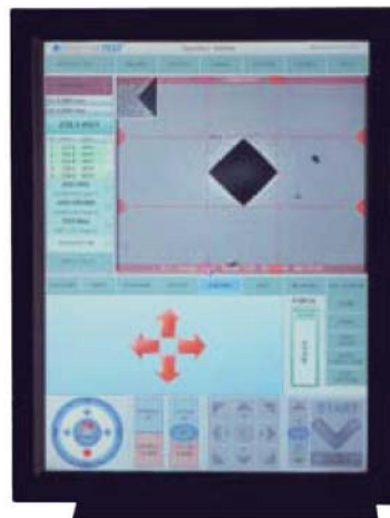
Magnified, Fine Adjustment