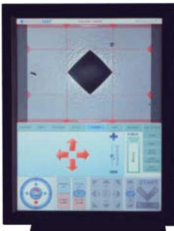
Full Screen, Zoom